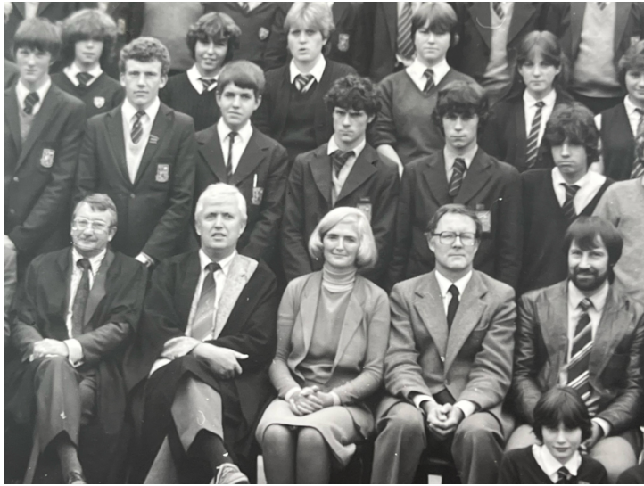
Teaching days at Newent