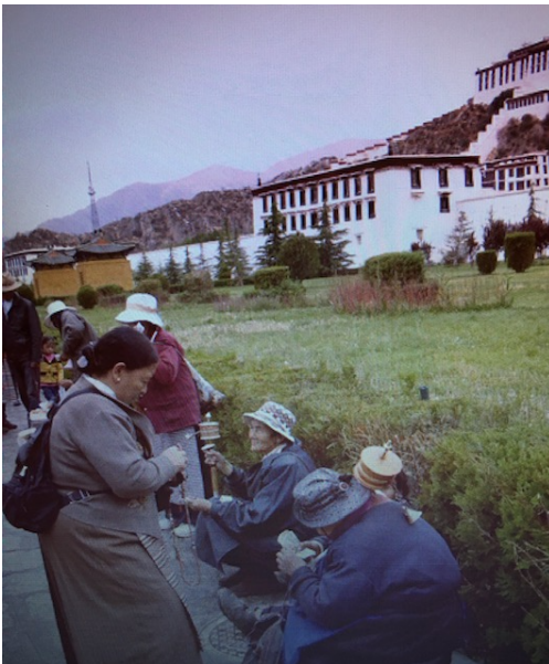
Summer palace, now managed by the Chinese...Tibetans begging nearby, a situation resulting from the Chinese occupation