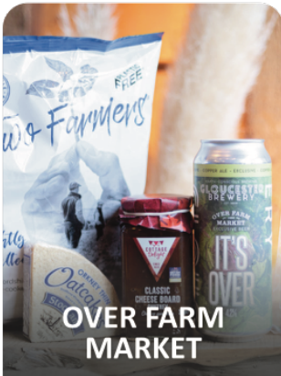
OVER FARM MARKET

For more than four decades, Over Farm been serving the lovely people of Gloucestershire. During that time we've expanded our services and are proud to welcome visitors to our award-winning Farm Shop, Café, family Farm Park, Venue Barn and Pick Your Own experience. See you soon?