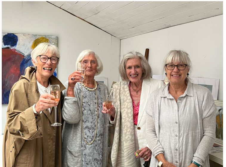
Celebrating with friends and family

Don't let tomorrow Make you rush through today, Or too many great moments Will just go to waste.