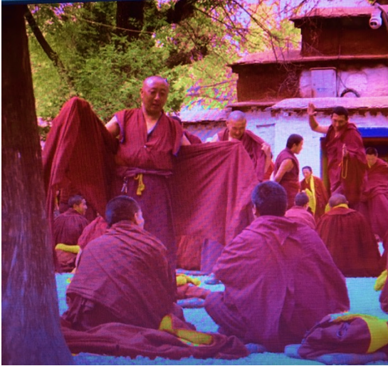
Teaching and debating session at the Monastery... very lively and rather noisy!

In around 2015 I had retired and was curious to see the world. Inspired by reading 'Seven Years in Tibet' a friend and I decided to visit Tibet. The Lhasa railway stopped in China in the Uyghur region where there is now ethnic cleansing and no-one can visit. Coming across the mountains on the railway the Chinese authorities blocked the remaining phones and made sure we could not identify where we were. Anyway...it was an adventure!