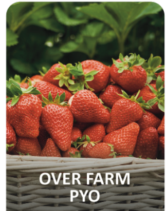
OVER FARM PYO