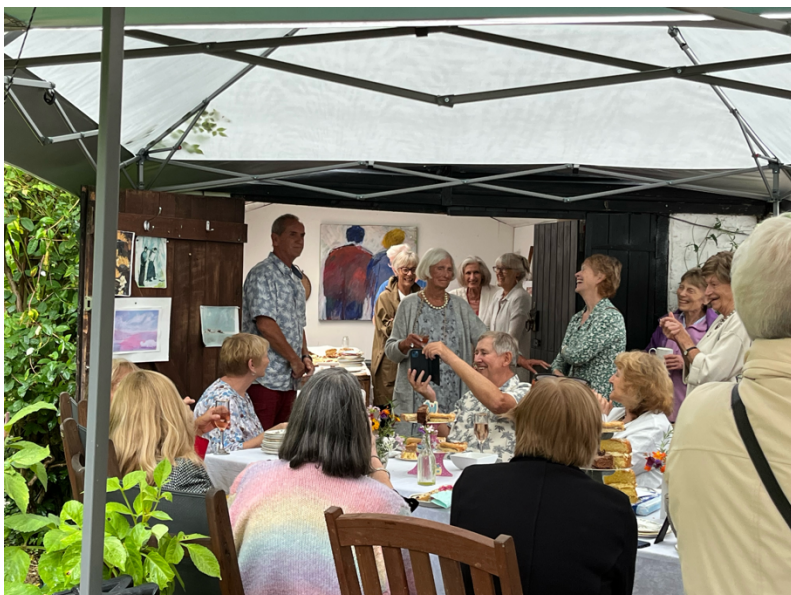
A chorus of Happy Birthday

And the person you're with, In that moment you share, Give them all your focus; Be totally there.