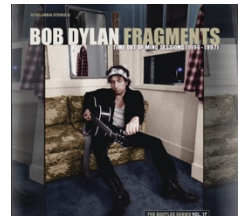
Image of latest album released Jan 2023

Blowin' in the wind became a symbolic song of fighting for the rights and equality of people in society and went on to become an anti-war song.