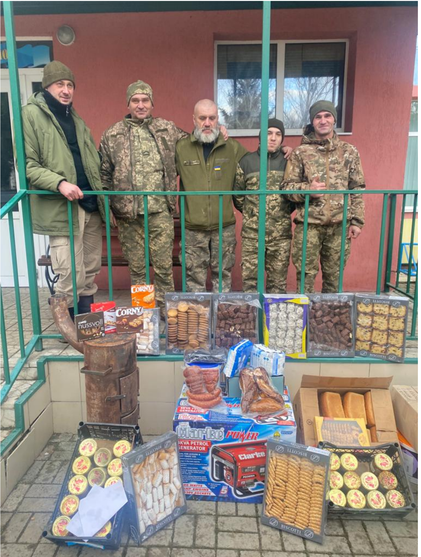
A Minsterworth funded generator delivered to Ukraine with food supplies from Gloucester